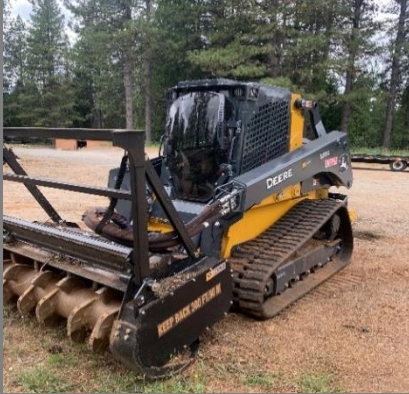
Grant Purchased masticator