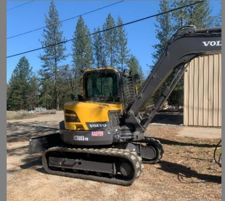
Grant funded mini excavator