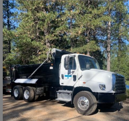
Surplus/CIP Funded Dump Truck