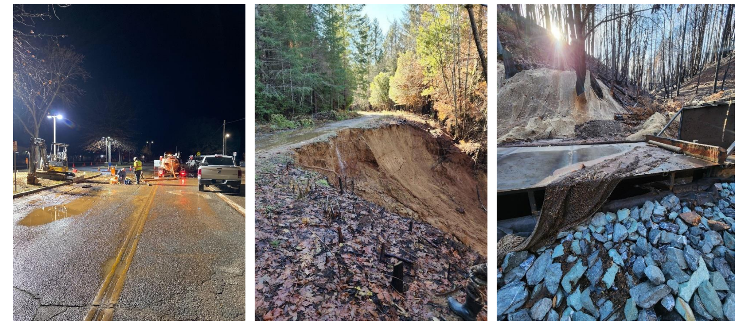
District crew repairing a break near Northside School.

Brown also reported that the field work demand has increased due to the storms. District crews have been responding to breaks, meter repair/replacement, and numerous after-hours call outs. Crews have been busy ensuring waste gates are open, so the water has a place to go and to limit blockages in the system. With the Governor's declaration of a state of emergency, Staff is documenting required field work that will be necessary to complete following the series of storms. A preliminary damage assessment has been submitted to California Office of Emergency Services for potential funding reimbursements.